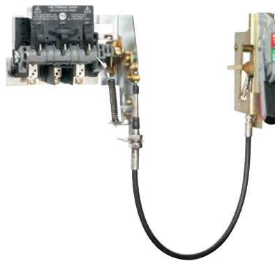
End of Life: 1494C Cable-operated Disconnect Switch (200...600 A)