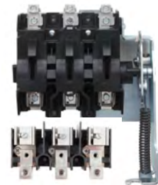
1494U Universal Disconnect Switch