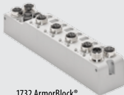
1732 ArmorBlock® IO-Link Master