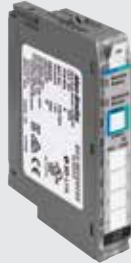
1734 POINT IO Master for POINT I/O™