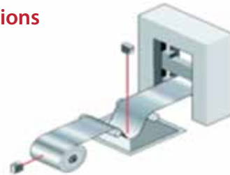
Diameter and Web Control