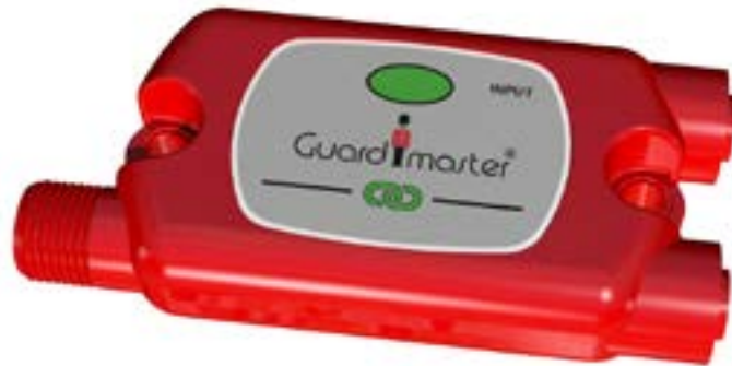
GuardLink Enabled Connection Tap

A truly connected enterprise has real-time control and information available across platforms and devices within the organization. When it comes to linking safety to The Connected Enterprise, our smart safety devices featuring GuardLink technology can deliver information, advanced functionality and flexibility, while enhancing safety and increasing efficiency machine- and plant-wide.