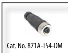
Cat. No. 871A-TS4-DM