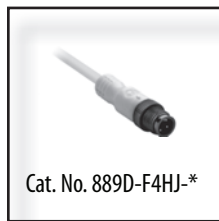
Cat. No. 889D-F4HJ-*