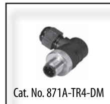
Cat. No. 871A-TR4-DM