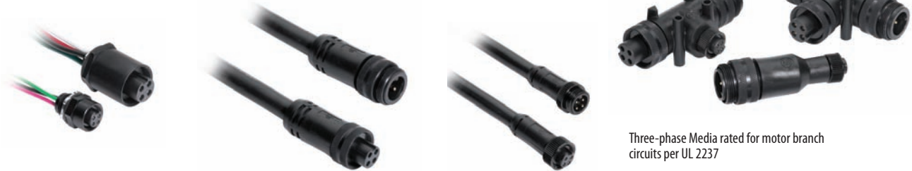
Three-phase Media rated for motor branch circuits per UL 2237

Reduced Commission and Installation Time