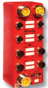
Bulletin 1732DS-IB8XOBV4 Safety I/O Module