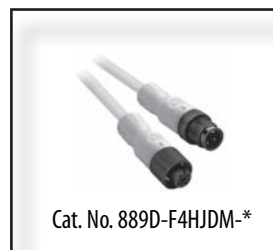
Cat. No. 889D-F4HJDM-*