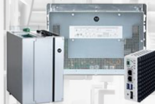
ASEM 6300T Intel Atom Class Book Mount Box PC and Thin Client