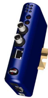
Anybus ControlNet Serial Gateway (AB7006)

The BAS system requires communication with varied sub-systems (ex. EPS, UPS, FAS, coolers, etc.). Most of these devices use the RS-485 interface and support the Modbus