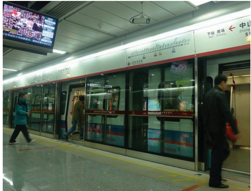
Guangzhou Metro Line 5

In light of Guangzhou's current economic development, continuously increasing population, and ever more congested traffic conditions, its regional economic integration is merely a blink away. Metropolitan rail systems provide numerous advantages such as large capacity, high efficiency, and low pollution emissions. These systems have become tools germane to solving transportation issues inherent to large Chinese cities. Using the original rail network as a foundation, construction of Guangzhou Metro Line 5 began in 2005 - thereby reshaping the metro network. Line 5 spans east to west and runs through Guangzhou City. In total the line stretches approximately 40 kilometers and includes 24 stations - the metro system plays a crucial role in the transportation network of Guangzhou City. In conformity to Guangzhou City's general strategic plan of "Into the East, unify with the West, attain harmony", Metro Line 5 adheres to rail line connection conditions set with the cities of Foshan, Dongguan and Shenzhen. Initial daily capacity supports up to 50 million passengers.