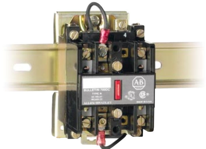
700 Type N