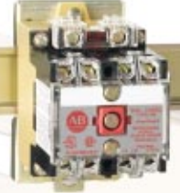
700 Type PK