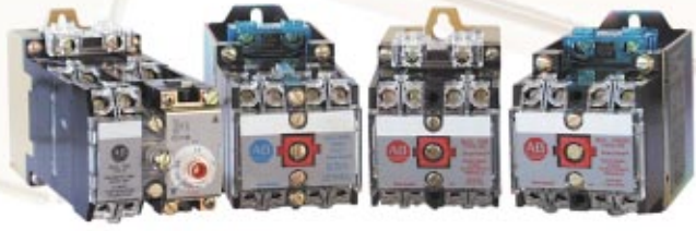
700DC-PT 700DC-P 700-PK 700DC-PK