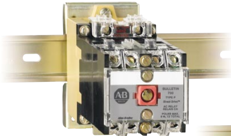
700 Type P