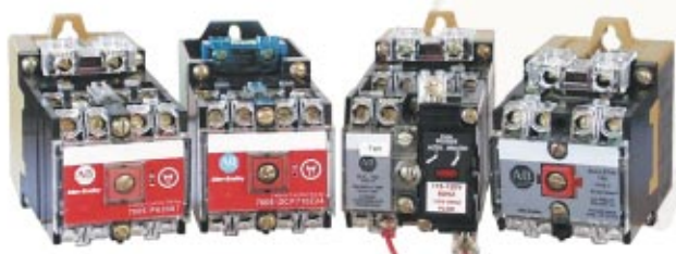
700S-P 700S-DCP 700-PT 700-P