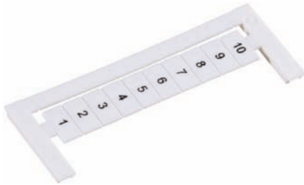
Pre-printed Marker Cards printed with ClearMark Printer