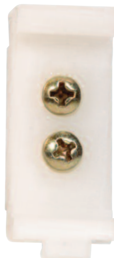
DIN Rail Adapter 140U-G-DRA2