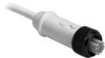
4-Pin EAC Micro Cordset