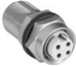
Power Bulkhead Pass-thru