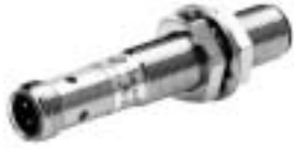
872C DC Micro Quick-Disconnect Style 12, 18, 30mm

Plastic Face/Threaded Nickel-Plated Brass Barrel