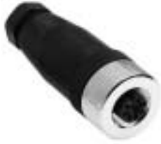
Straight Female Micro Style Terminal Chamber