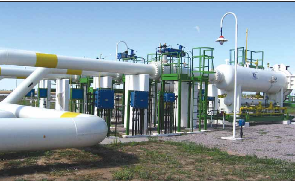
Transportadora Gas del Sur's (TGS) Bajo el Gaulicho gas compression plant is one of 16 compressor plants along TGS's 3,756-km (2,334-mile) General San Martín gas pipeline.