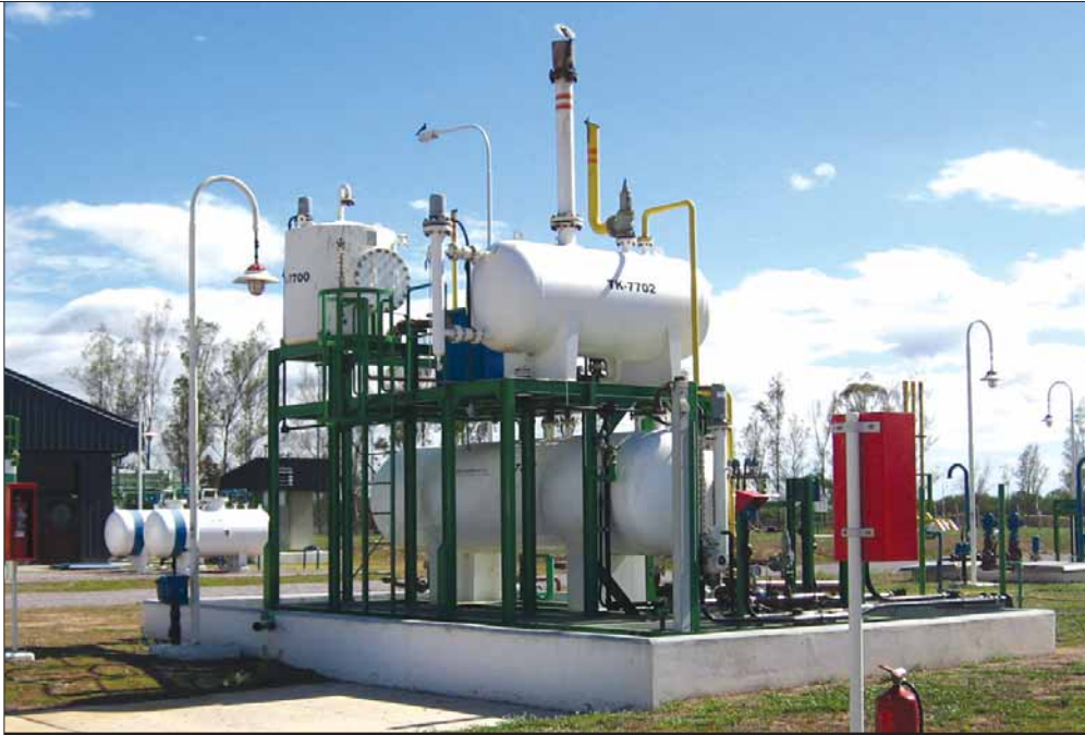
At the Bajo el Gaulicho gas compression plant, the wastewater treatment skid is where all of the impurities that enter the plant — primarily water and oil — are separated from the gas. The majority of the impurities are filtered in the entry separators, but others come from the turbocompression lubrication circuit.

The project was a true collaboration between Eledisa and Rockwell Automation Argentina and included Gustavo Campetella, vice president