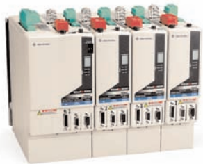
Allen-Bradley® Kinetix® 6000 Servo Drive