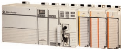
Allen-Bradley® CompactLogix™ Programmable Automation Controller