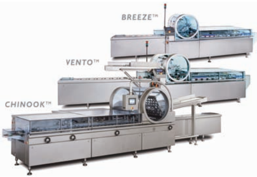
Langen's End Load Cartoner Family