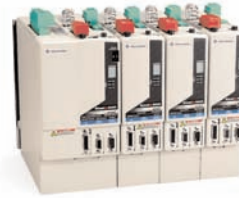
Allen-Bradley® Kinetix® 6000 Servo Drives

Langen Packaging Group selected the Allen Bradley® CompactLogix™ programmable automation controller (PAC), PanelView™ Plus 700 HMI, and Kinetix® servo drives for motion control. The Rockwell Automation solution provides control and motion functionalities integrated in the single Logix platform. Relays and fuses, pushbuttons, beacon lights, and interlock door switches from Rockwell Automation are also used on the machines.