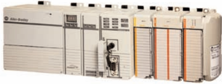
Allen-Bradley® CompactLogix™ Programmable Automation Controller