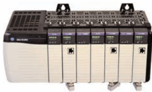
Allen-Bradley® ControlLogix® Programmable Automation Controller