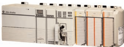
Allen-Bradley® CompactLogix™ Programmable Automation Controller