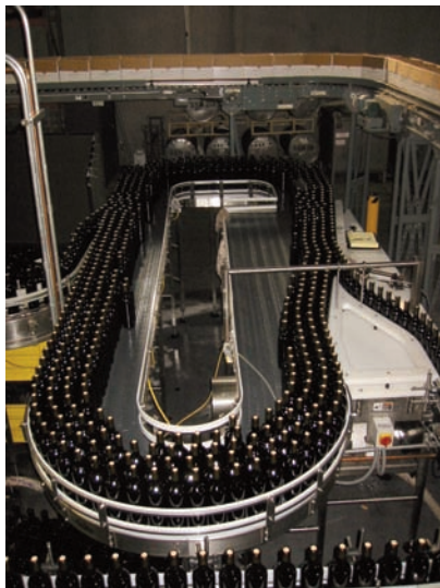
Bottles traveling on the Infinity Accumulator

At the core of its Infinity accumulators is the Allen-Bradley CompactLogix™ Programmable Automation Controller (PAC). The PAC provides a full range of automation disciplines including discrete, motion, control and drive applications on a single control platform. By integrating with other equipment on the line, the controller helps Garvey's customers improve productivity and reduce total cost of ownership.