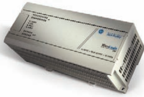
Allen-Bradley® MicroLogix™ 1000 Programmable Logic Controller