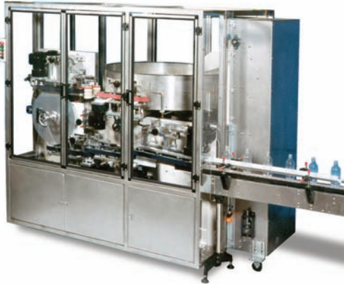
New England Machinery's Model NEHCPE Compact Unscrambler