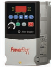
Allen-Bradley® PowerFlex® 4 Variable Frequency Drive